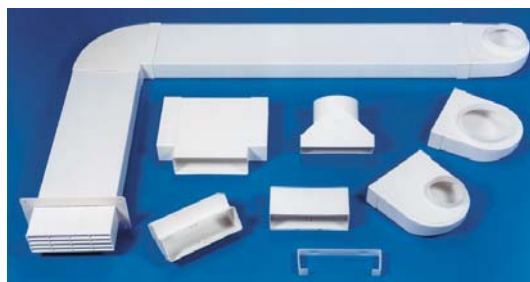
Easi-Vent 204 Range