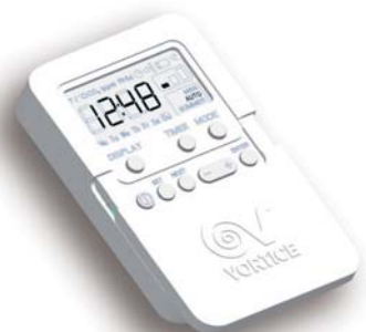
RF Remote Controller