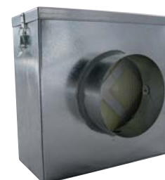
External Filter Box

Galvanised filter box (F5) designed to simplify maintaining the VORT PROMETEO HR 400. The filter box is fitted to the outside of the appliance and protects the intake and outlet ducts serving various rooms (replacing standard filters). Time spent on maintenance is less (thanks to a specially sized filter that gives constant filtering characteristics even when the unit is used for long periods), and maintenance work is simplified as direct access to the Prometeo unit is not required.