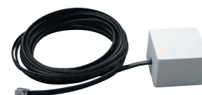
External RF receiver Module

An additional remote-controlled radio frequency RF device including a connection cable is available as an optional accessory and allows control of the appliance even if the position chosen for its installation is shielded from radio waves.