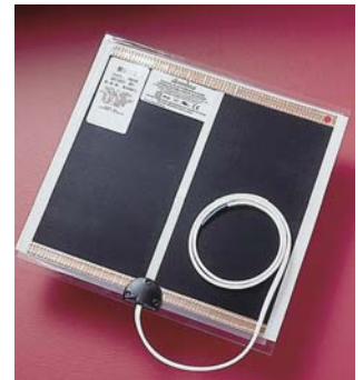
BACK VIEW To be placed on facing wall