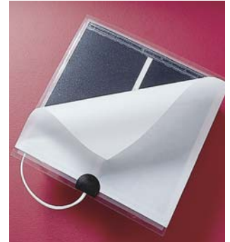
SELF ADHESIVE To be placed on back of mirror

5 year warranty against any manufacturing fault, providing it is fitted strictly in accordance with instructions supplied.