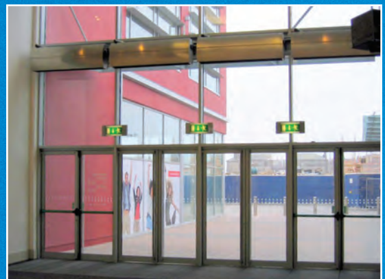
West Entrance Lobby

• There are 4 x S10-150WR Recessed LPHW Air Curtains installed on the entrance into the main lobby of the Shopping Centre.