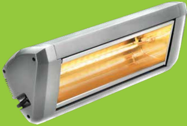
ATC Sienna Low Glare IP55 Heater